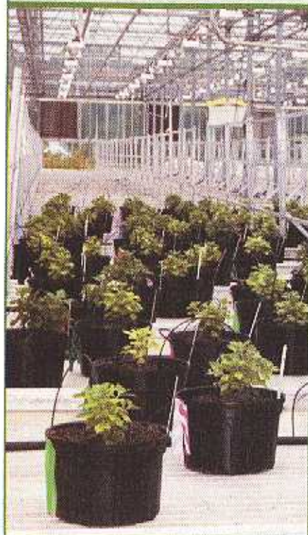
Young basil plants at the Rutgers Agricultural Extension.