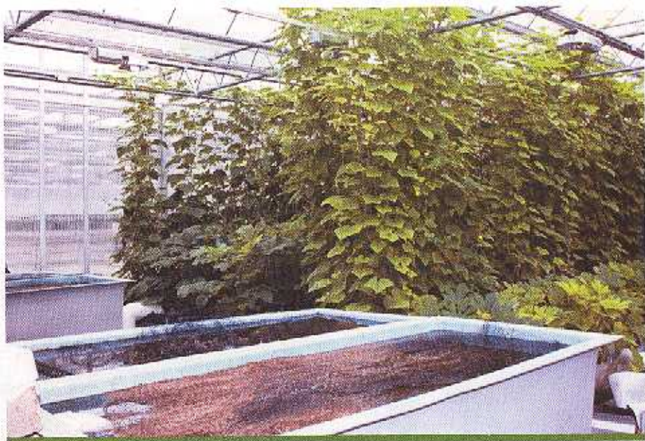
Intermediate water filtration system, at Rutgers facility.

The growing season begins when a shipment of 700 young tilapia arrives from an aquafarm in St. Croix (whose research was instrumental in initiating the tilapia farm at the Florence greenhouse). The young fish weigh less than .5 ounces and are .25 inches long when they are placed in two small tanks that serve as the nursery. Initially they are fed 10 percent of their body weight each day. The tilapia remain in the nursery for 12 weeks until they reach a weight of approximately 1.75 pounds grams. Then the tilapia are moved to larger tanks for another 24 weeks. At that point, they are shipped to market. (The fish are available at Four Seasons Seafood Incorporated in the Chinatown section of Philadelphia.) In all, the growing season takes nine months.