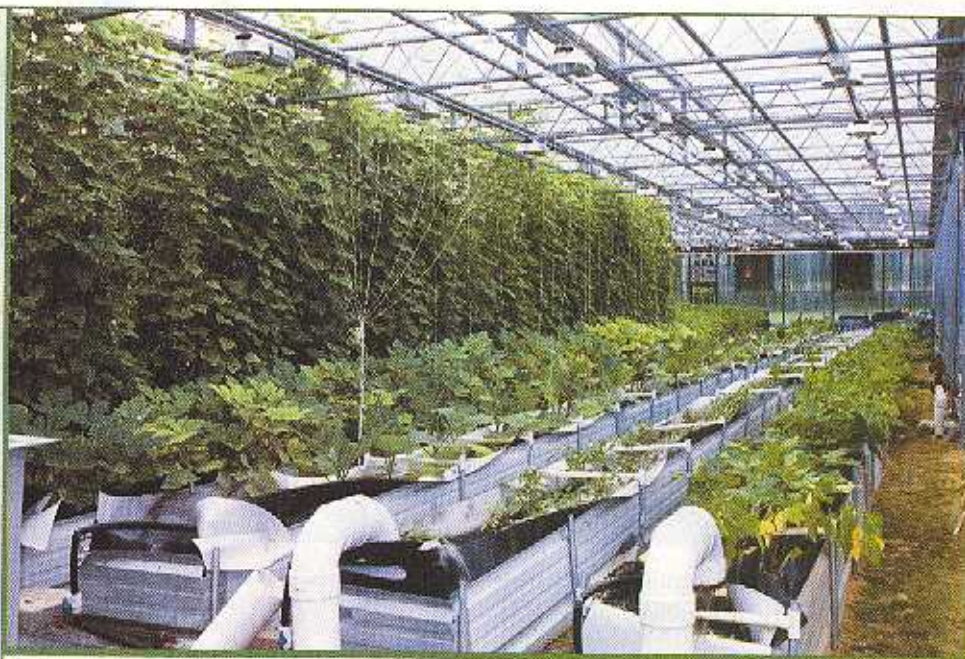
Water feed-in system from Tilapia tanks.

214 North Tenth Street Philadelphia, PA (215-925-6625)